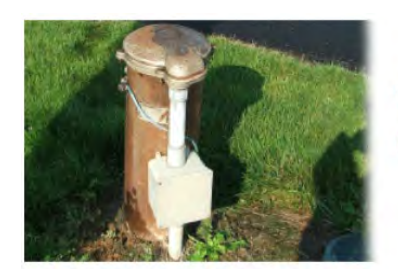
Well Water Safety Maintaining safe water for you and your family